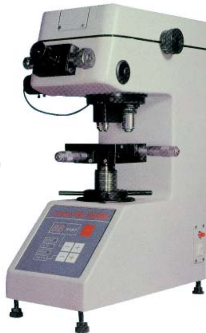
Order No. 950-1511