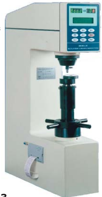
Order No. 950-1503

It serves to measure the hardness of ferrous, non-ferrous metals, carbide, Carburized or nitride layers, and other chemical treating layers. It is also used to for the hardness test of thin pieces.