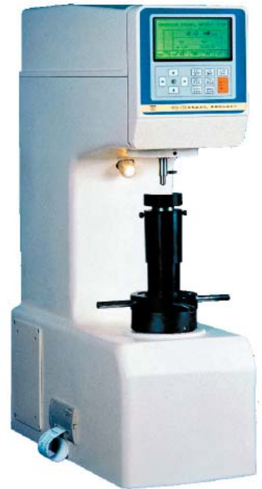
Order No. 950-1501

Five pieces of harness brocks: HRC higher and Lower, HRB, HRN, HRT.